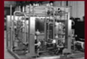
2,500 lph Fruit juice Pasteuriser