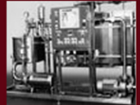
10,000 lph Vinegar Pasteuriser