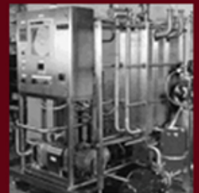
2,500 lph (variable) Cream Pasteuriser