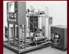
500 lph Milk pasteuriser with Homogeniser

From complete systems to individual pieces of equipment and from components to service, at SS Engineers our engineers and support staff will work with you to ensure your plant achieves the quality of product and efficiency you require.