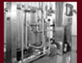
2,500 lph Fruit juice and cider pasteuriser